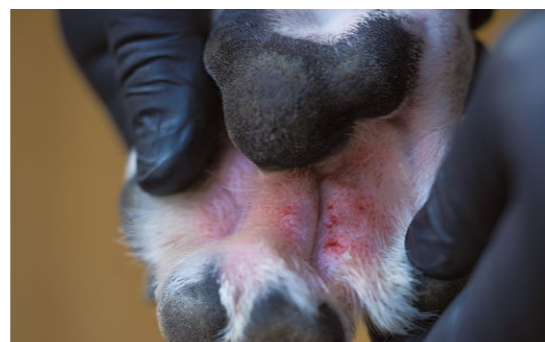
photo. 2. Paw of a dog with atopic dermatitis and food allergy