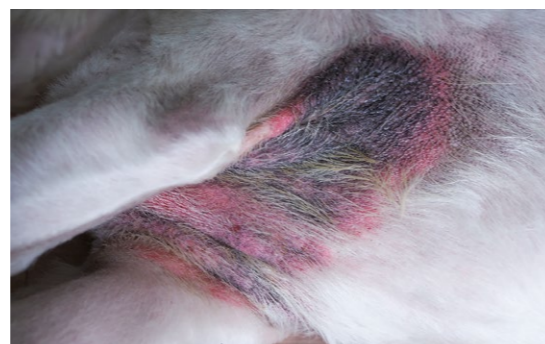
photo. 3. Dog with a fungal lesion