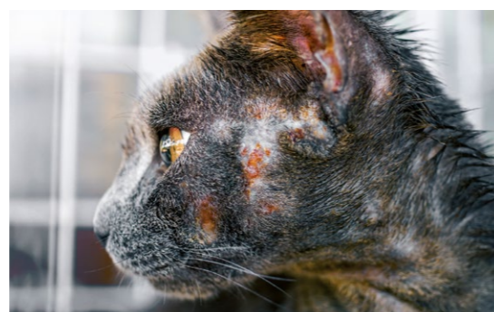
photo. 4. Cat with bacterial lesions